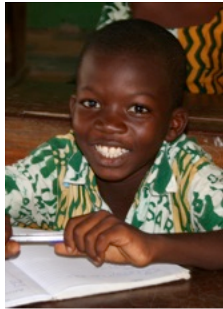
Student at First Star Academy, a private school close to Omanhene's production facility in Ghana.

Omanhene supports the recent effort of the Government of Ghana to undertake a Pilot Study on Child Labour, the first installment was recently published. The Pilot Study (sponsored by disinterested third-parties to assure impartiality) seeks to visit each of the more than 600,000 individual cocoa farms in Ghana and gather data against more than 100 benchmarks. Significant benchmarks include, for example, school attendance by children during the previous week (if children did not attend school the previous week, that might indicate that they are being prevented from attending school and thus subjected to the "worst form of child labor" as defined by international law). The first set of data from the Pilot Study shows that there is no systemic exploitation of child labor in Ghana. This conclusion comports with less scientific, anecdotal reviews.